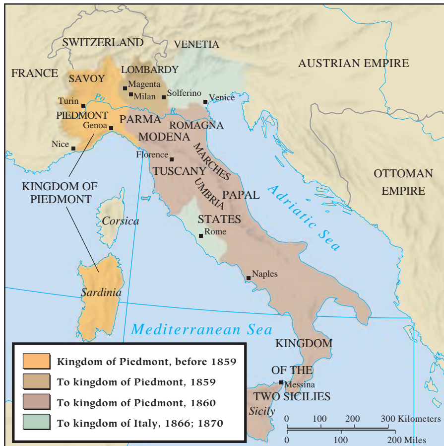
MAP 22.1 The Unification of Italy.

Italian unification might have stopped here as there is little indication that Cavour envisioned uniting all of Italy in the spring of 1860. But the forces of Romantic republican nationalism forced Cavour to act. Giuseppe Garibaldi (1807–1882) was a dedicated Italian patriot who had supported Mazzini and the republican cause of Young Italy. While in exile in Latin America, he had gained much experience in guerrilla warfare, which he put to good use in the Italian revolutionary struggles of 1848–1849. In 1859, he became involved in the fighting against Austria. Cavour regarded Garibaldi as a nuisance and encouraged him to move on to southern Italy where a revolt had broken out against the Bourbon king of the Two Sicilies. With